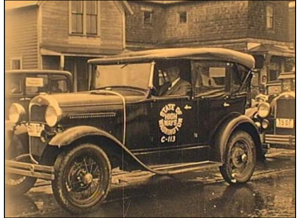
This is a snapshot from one of films — the opening of the Aberdeen-Willapa Highway in 1927, taken in Cosmopolis.

In March this year we were honored to show the premiere screening of the Newsreels of C.D. Anderson, a documentary produced by UWTV. The documentary covered UW Libraries Special Collections digital restoration of 53 35MM nitrate newsreels donated by a Seattle couple who had picked them up at