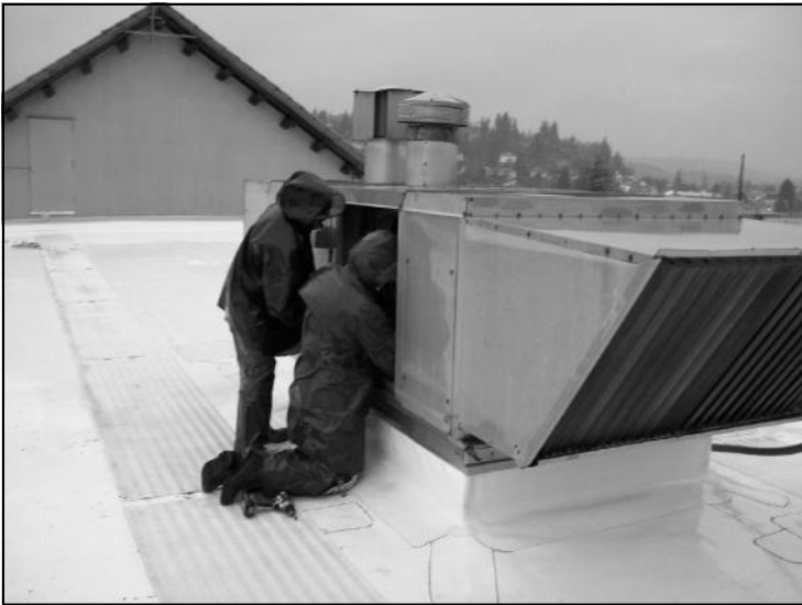
The above photo is of workers on the roof repairing the existing furnace during a rainstorm in January 2012 after one of the breakdowns.