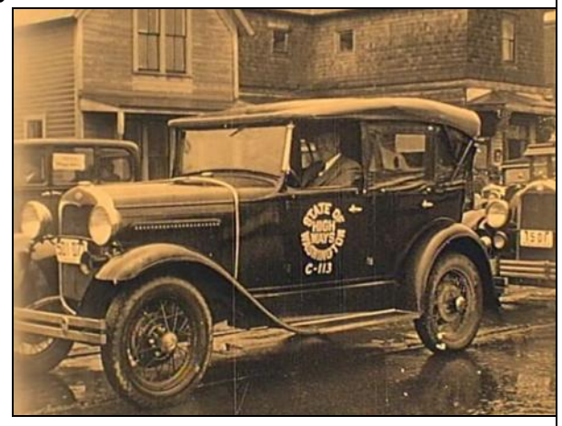
This is a snapshot from one of films — the opening of the Aberdeen-Willapa Highway in 1927, taken in Cosmopolis.

In 2004 the UW Libraries Special Collections came into possession of 53 35MM nitrate newsreels donated by a Seattle couple who had picked them up at a garage sale. Through funding from the Apex Foundation, the Libraries staff was able to have these films digitized. The films