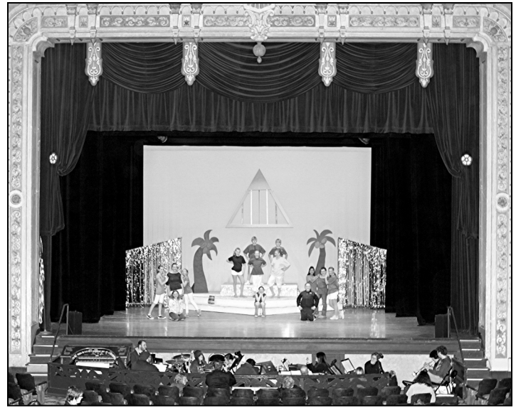
The new grand drapes and valance during the Hoquiam High School Drama Production "Joseph and the Amazing Technicolor Dreamcoat"