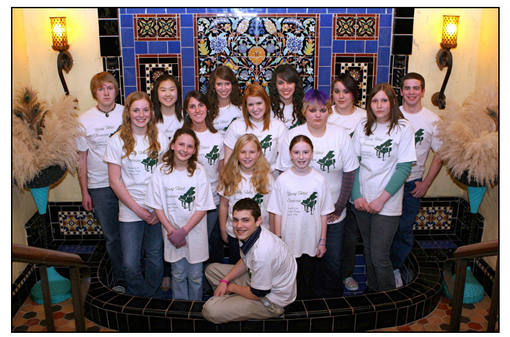
Young Artist Showcase 2008

For the past several years, the 7th Street Theatre Association has produced events featuring artists from Grays Harbor and surrounding communities.