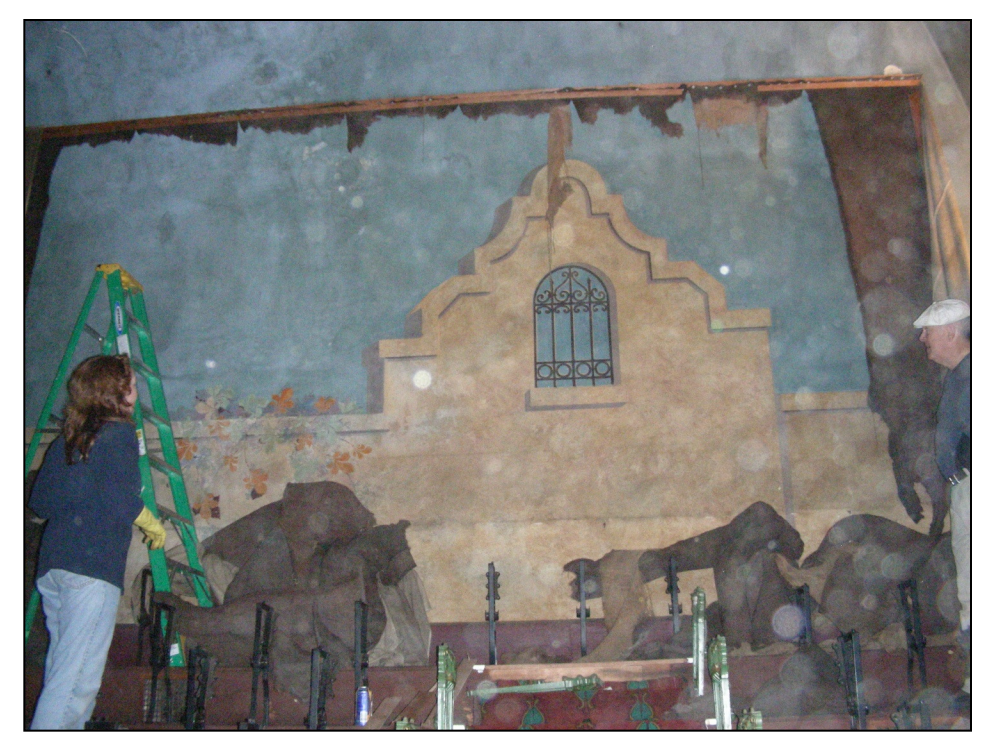
Board members remove the old sound baffles and uncover original murals

We recently received a $2,500 grant from Grays Harbor County for the preservation of these murals. We are working with an historic paint specialist to preserve the murals and perform a survey for restoration of some of the other historic finishes in the theatre.