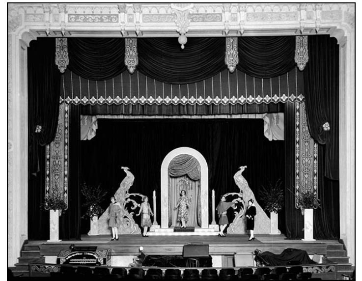
The original grand drape and valance scheme as seen in this photo from the Jones Photo Historical Collection which was taken at a fashion show in 1929. (See Blast from the Past, p. 4)