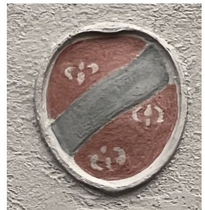
Above shows a close-up of the detail of each medallion located above the shops.