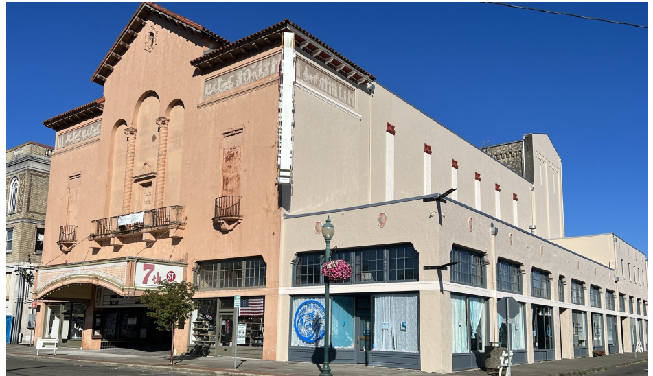
Above shows the completion of Phase 2. As you can see, the front of the theatre still needs to be restored to its original design, which includes fleur de lis in the central alcoves and sailing ships in the balconies.

The contractor, EverGreene Architectural Arts, began the project at the end of April. We were extremely fortunate that the weather cooperated. They worked through mid-May sealing cracks in the walls, applied two coats of paint, and performed extensive filling, sealing and painting of the shop windows. The exterior color was changed as part of this project and is a significant improvement. Decorative features and stenciling were completed. These beautiful details have not