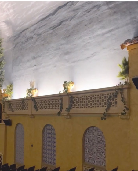
Showing off the new LED lighting, which has the option of an array of colors.

This spring the auditorium lights were upgraded to LED. These are the lights along the side walls, and the two hanging fixtures that light the stage. It is more energy efficient, and audience members can now read programs!