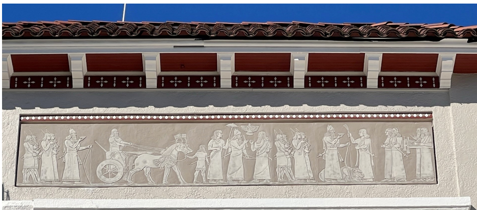
This is the Assyrian panel located on the J Street side. Three panels took five months to create. They are modeled after the originals, using resin and plaster for the molds with a fiberglass backing.