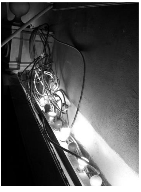
A view of the lights mounted above the façade walls in the auditorium.

These two projects would be a huge improvement for our audiences to fully enjoy our events.