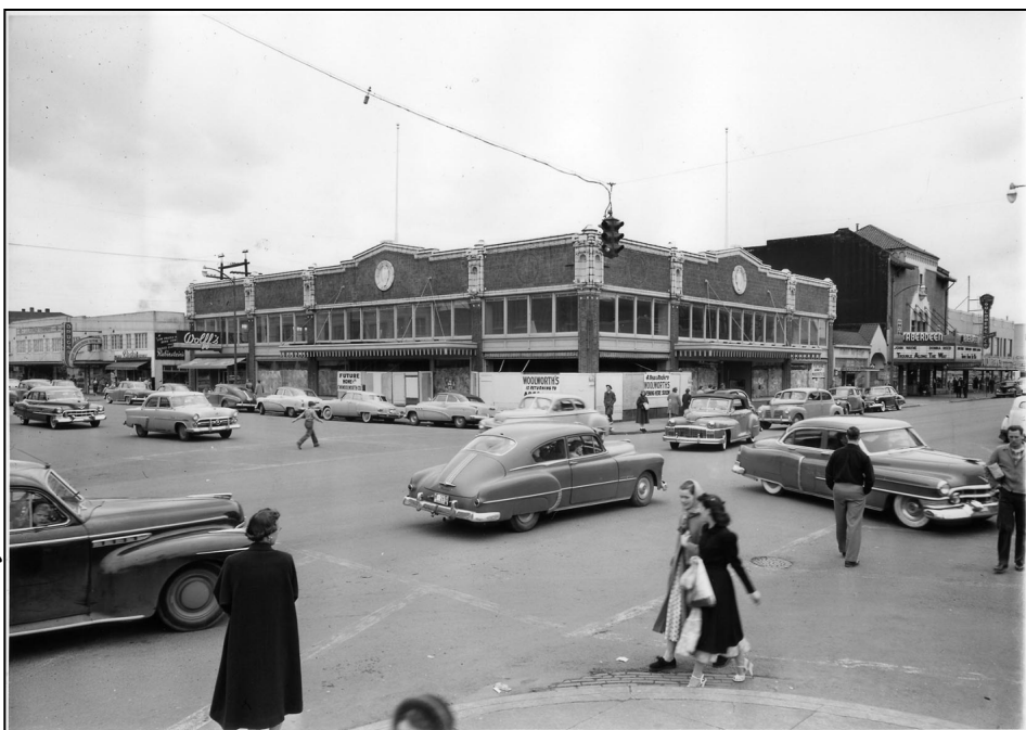
Corner of Market and Broadway in Aberdeen in 1953 shows that a "new and modern" Woolworth's is going into the building which now houses Moore's Furniture.

The event is a fundraiser for a lighted candlestick sign. (see page 7).