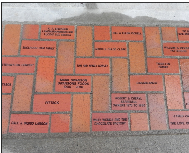
A section of the engraved bricks in front of the theatre