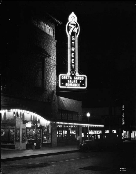
Original sign in 1930.

A fire alarm system is the next project at the 7th Street. We have funding set aside from a State award in 2009 which will be used for this project. The next project will be a new candlestick sign on the corner of the building.