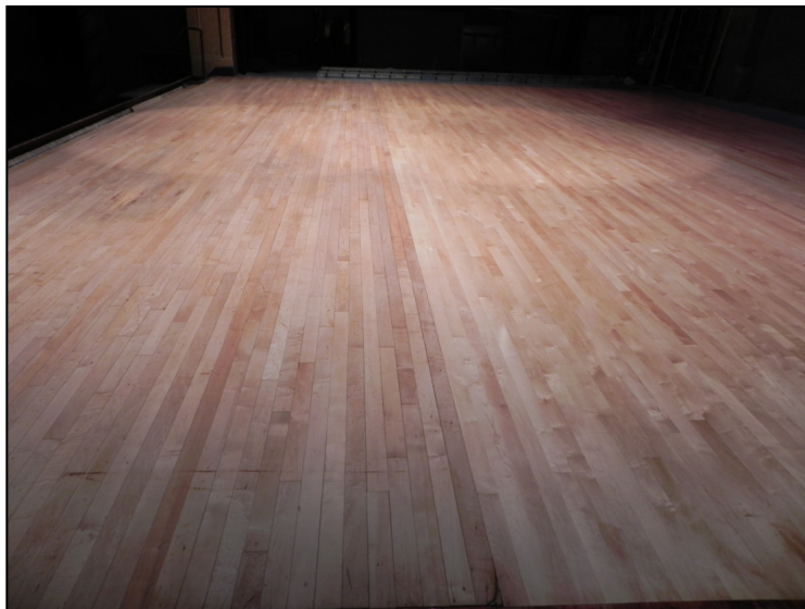
New stage floor—the original maple slightly darker, is on the left.