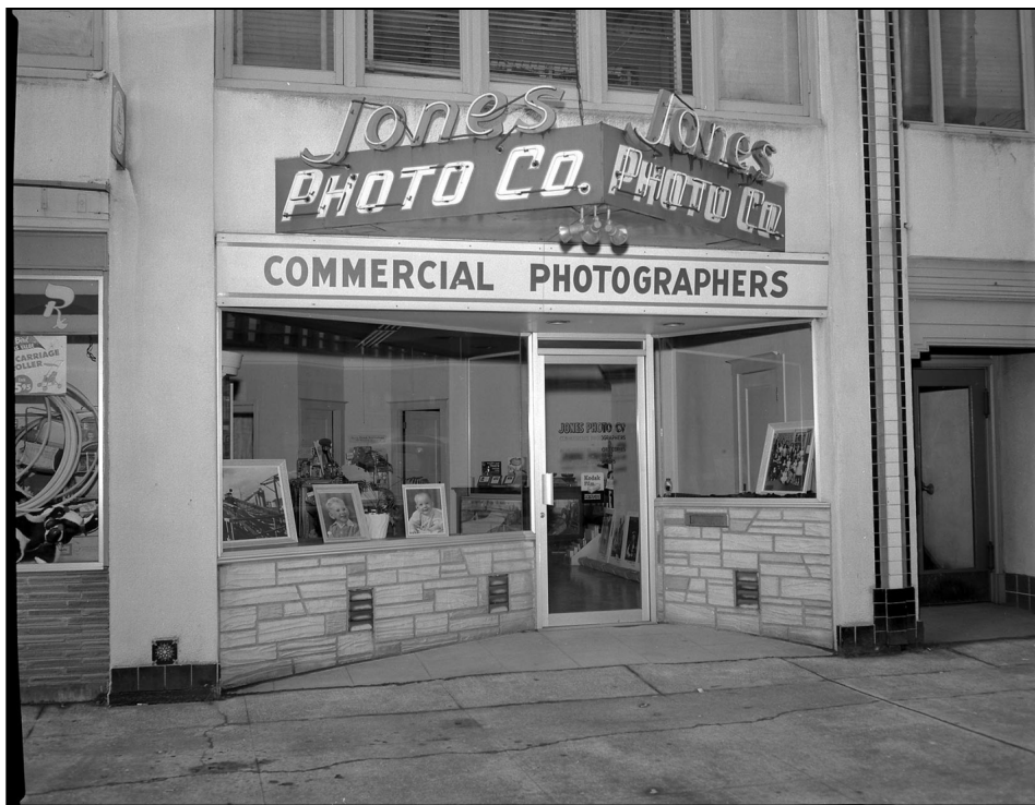
1958 photo of the Jones Photo Studio 1 Street across from the Becker Building (no longer standing)

There are more than 10,000 pictures on the website, and they each contain original information about the photo including the year and photo number. The photographs are