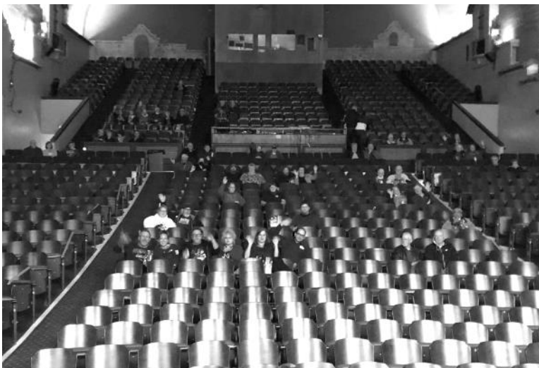
This was taken Friday Sept. 18 at Ring of Fire, a 1961 film which had many scenes filmed in the Wynoochee area. This is 57 people spread out in the auditorium before the movie.