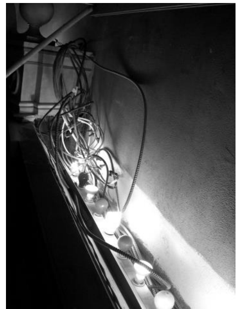
A view of the lights mounted above the façade walls in the auditorium.

These two projects would be a huge improvement for our audiences to fully enjoy our events.