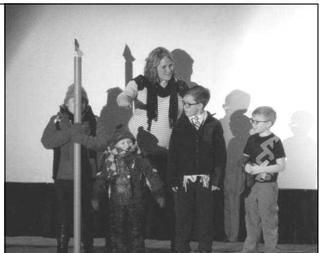
Four kids participated in the "dress up as your favorite movie character" contest. The little boy second from the left won. He was dressed up as Ralphie's little brother, Randy. The audience loved him!

We had 480 people walk through the door—families and children. It was a fantastic way to kick off the holiday season and end our 2014 classic movie series!